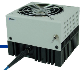
Typical Radiant Flux 1,2 (mW)